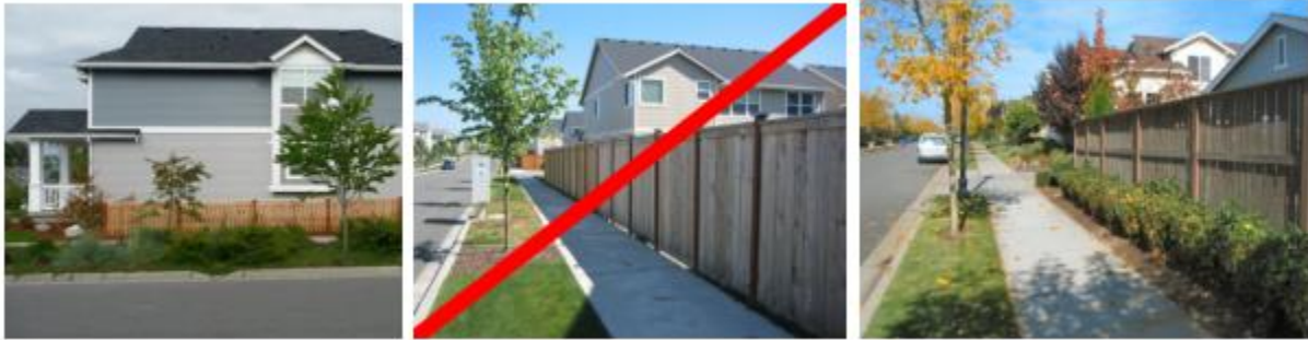
Figure 15.320.130(A)(2). Acceptable and unacceptable fences on corner lots for side yard/flanking streets or along reverse frontage lots where the back yard abuts a street. The left example is a low picket fence. Taller fences like that in the middle image are acceptable along the side and rear yard, but are not allowed within five feet of a sidewalk. The right image shows an acceptable example where the fence is set back away from the sidewalk to allow space for landscaping.