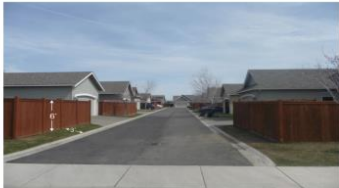
Figure 15.320.130(A)(3). Acceptable fences along an alley. The 42-inch fence on the left is allowed along the edge of an alley. The taller six-foot fence in the middle is allowed with a three-foot minimum setback from the alley.